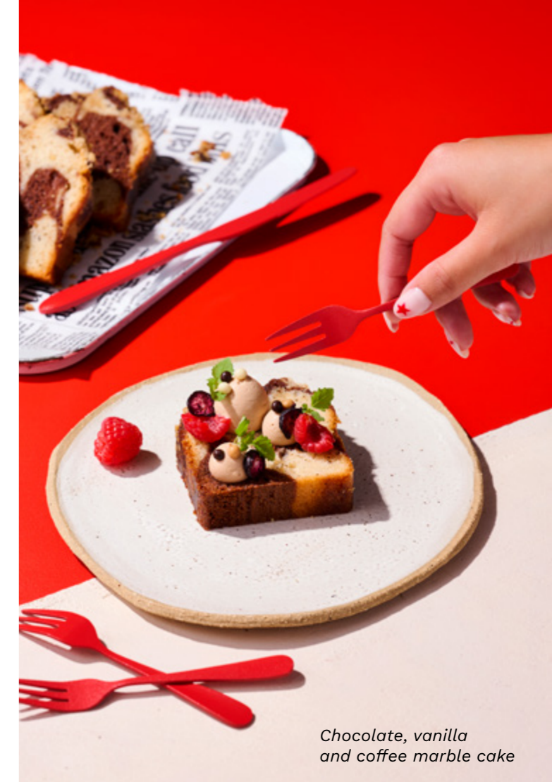
Chocolate, vanilla and coffee marble cake