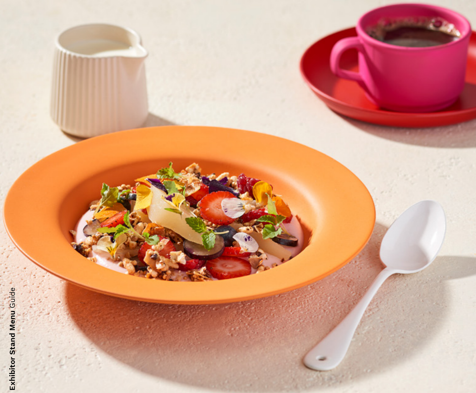
Strawberry gum yoghurt with blueberries and granola