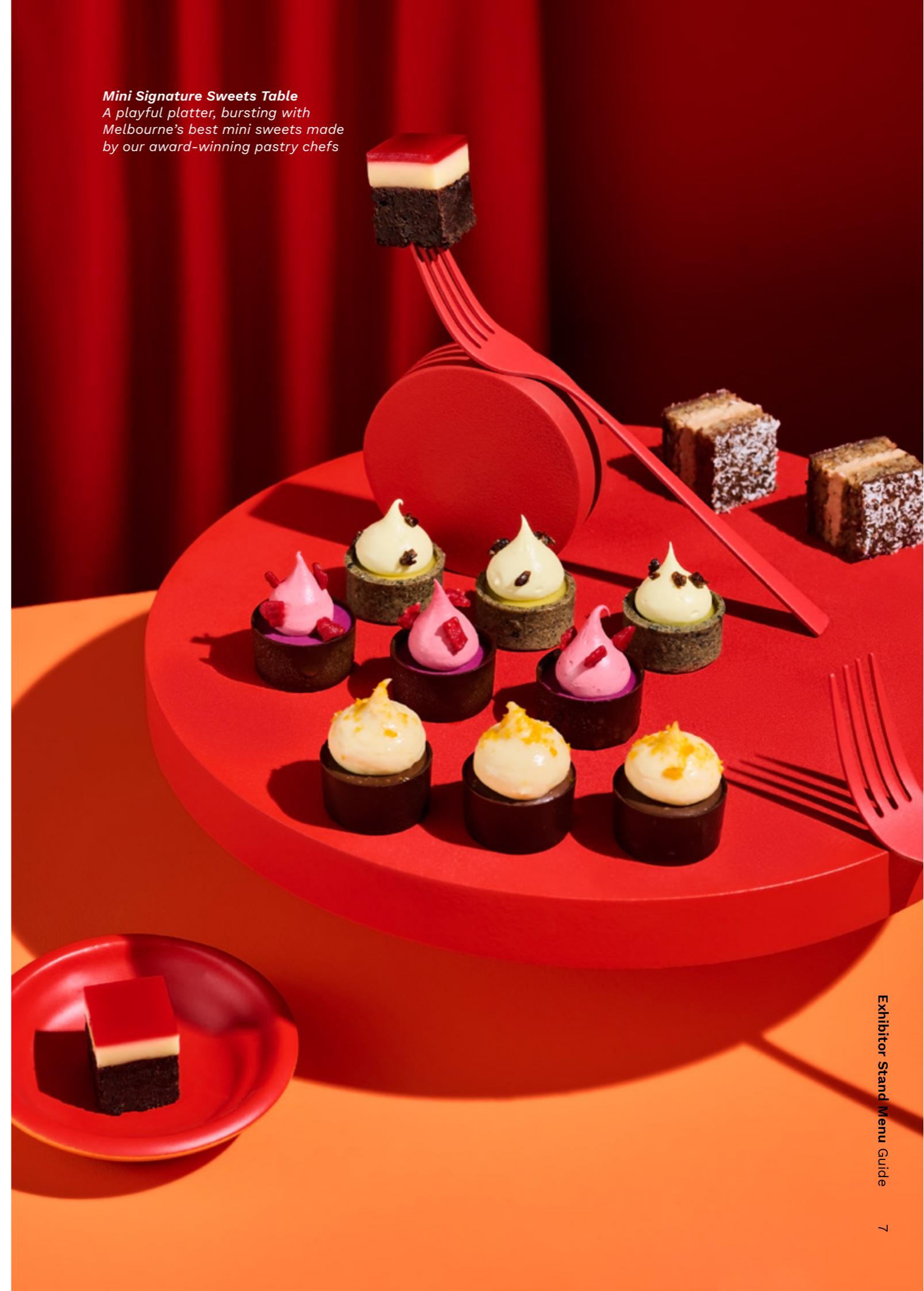
Mini Signature Sweets Table A playful platter, bursting with Melbourne's best mini sweets made by our award-winning pastry chefs