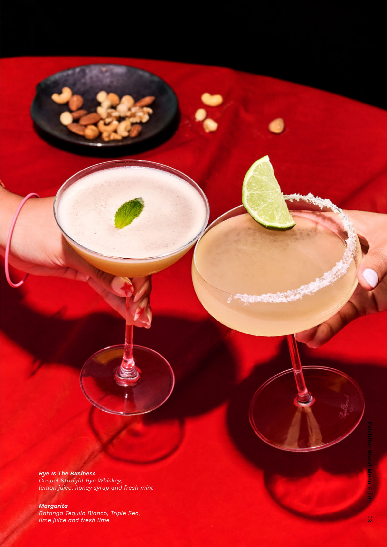
Rye Is The Business Gospel Straight Rye Whiskey, lemon juice, honey syrup and fresh mint

MCEC offers a range of beverage products for your stand. Under the Victoria State Legislation, service of alcohol requires staff with a current Victorian Responsible Service of Alcohol (RSA) Certification. The number of staff required will be determined by the size of your order. Service of alcohol must cease 30 minutes before the bump out of an event.