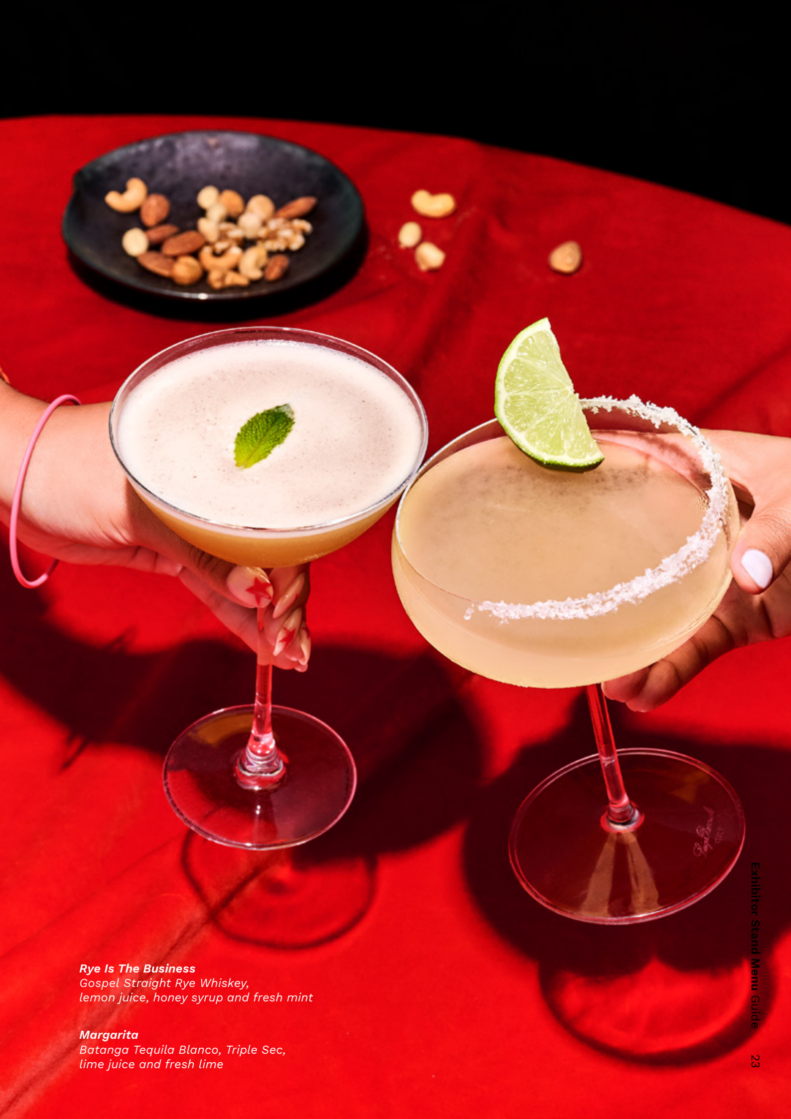
Rye Is The Business Gospel Straight Rye Whiskey, lemon juice, honey syrup and fresh mint

MCEC offers a range of beverage products for your stand. Under the Victoria State Legislation, service of alcohol requires staff with a current Victorian Responsible Service of Alcohol (RSA) Certification. The number of staff required will be determined by the size of your order. Service of alcohol must cease 30 minutes before the bump out of an event.