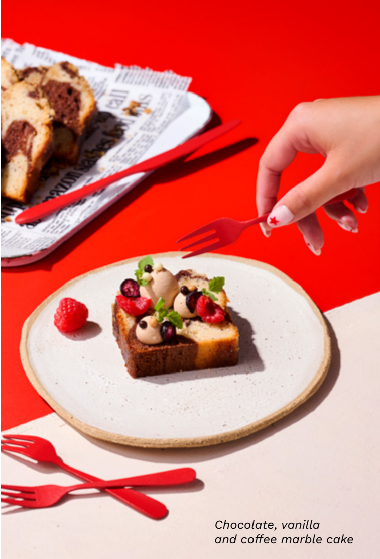
Chocolate, vanilla and coffee marble cake