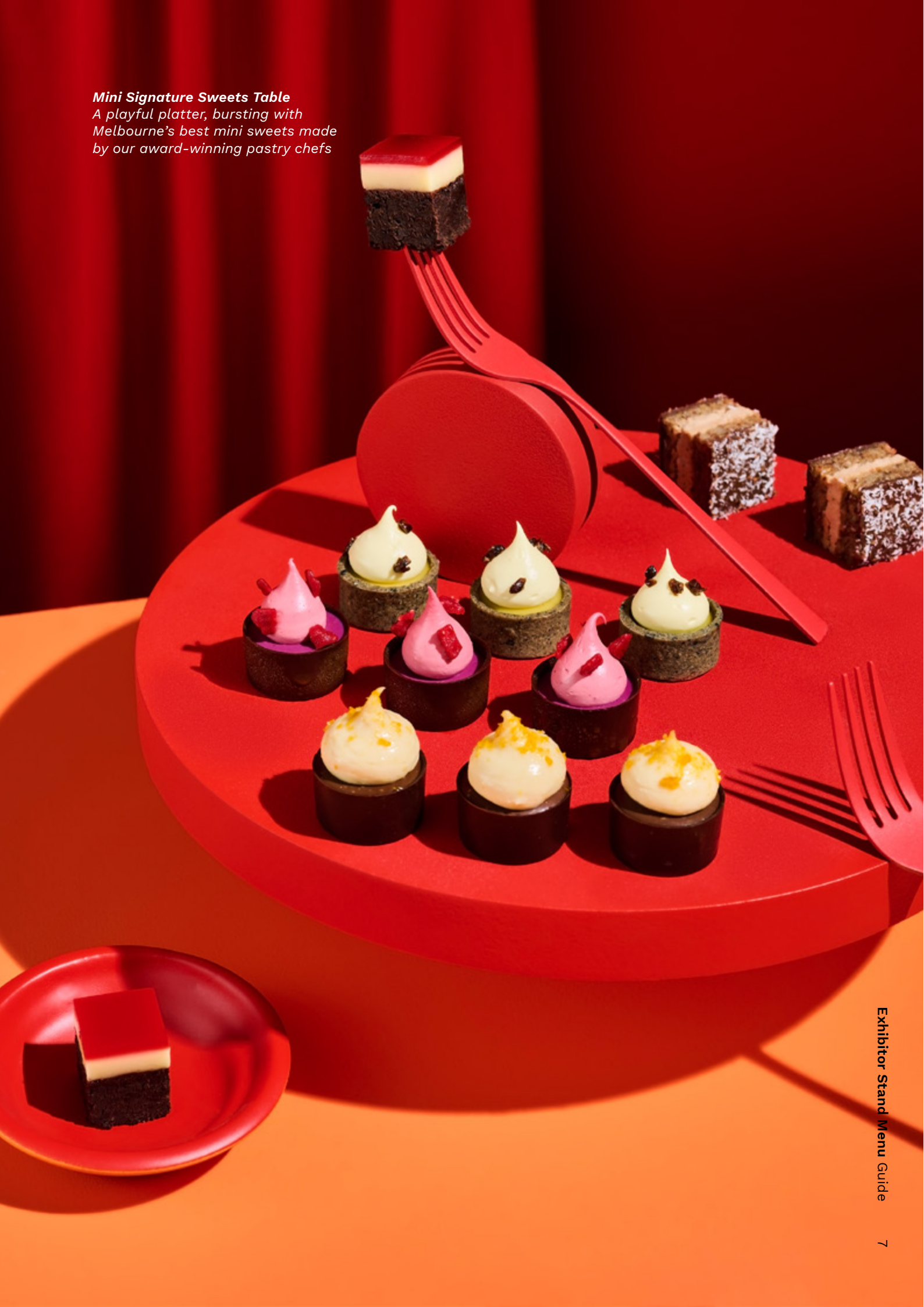
Mini Signature Sweets Table A playful platter, bursting with Melbourne's best mini sweets made by our award-winning pastry chefs