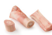
Small & large bones (red meat)*