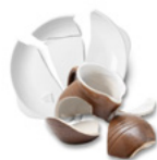
Broken ceramics and glassware