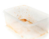
Take-away boxes (containing food)