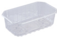
Fruit punnets (plastic) 1-5 only