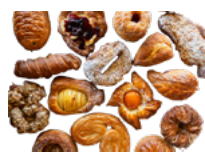
Bread, cookies and pastries (leftovers)