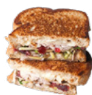
Sandwiches/ finger food (leftovers)