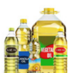
Vegetable oil (bulk)

Collection Services - This includes a combination of dedicated waste collection services that are currently in place and ad-hoc waste collection services that require a booking to be made. To arrange an ad-hoc waste collection service, please log a request through the BGIS Helpdesk on x8999 or via email: mccd.helpdesk@apac.bgis.com