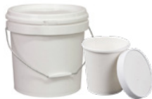
Tubs with lid (plastic)