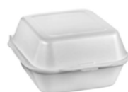
Styrofoam (clam shells/cups)