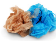
Coloured soft plastic