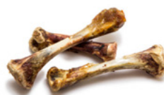
Small bones (fish/chicken)