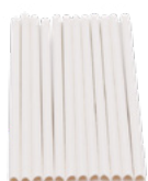
Drinking straw (paper)