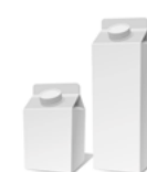
Milk cartons (tetrapak)