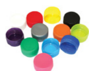
Loose bottle lids (plastic, metal)