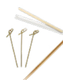
Wooden/ bamboo utensils (chopsticks, picks, stirrers)