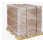
Pallet shrink wrap

Soft Plastic - Please prevent any contaminants from entering the soft plastic bin. All items to be clean and free of contaminants i.e. food and drinks. Chip/biscuit/confectionery wrappers are to be placed into the landfill bin.