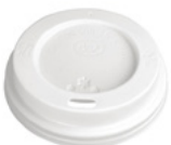
Coffee cup lids (plastic)