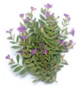
Flowers and plant material