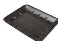
Meat trays (foam)