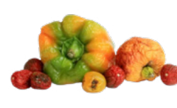
Fruit and vegetables (spoiled)