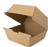
Burger and chip boxes (clean)