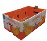
Cardboard (wax coated/plastic)