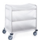
Plastic trolley covers