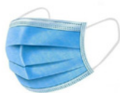
Face masks (disposable)