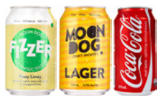
Beer/drink cans (aluminium)