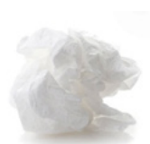
Paper towels (used)