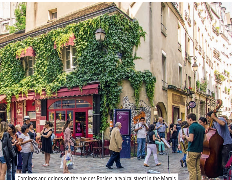
Comings and goings on the rue des Rosiers, a typical street in the Marais