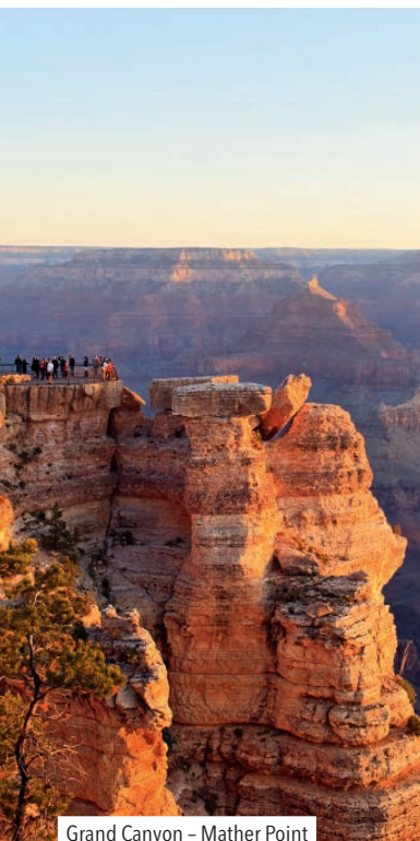
Grand Canyon – Mather Point

of road movie charm, the terrace of Cruiser's Cafe 66 ( cruisers66.com ).