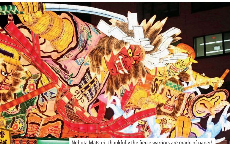
Nebuta Matsuri: thankfully the fierce warriors are made of paper!

one of Japan's wildest summer events. Daily May–Aug 9am–7pm, Sept–April 9am–6pm, closed 31 Dec/1 Jan, 9/10 Aug | admission 600 yen | 1-1-1 Yasukata | 安方 1-1-1 | 1 min on foot from JR station Aomori | 🕒 1-1½ hrs