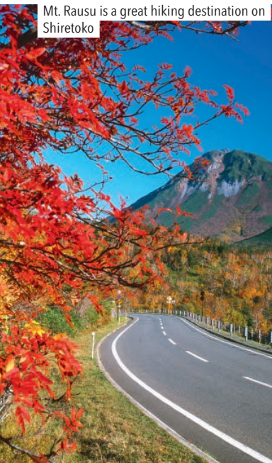
Mt. Rausu is a great hiking destination on Shiretoko

An adventure on the northern side of Shiretoko: watch bears catching salmon in the river from the safety of your boat. At approx. 3,000 animals, this is Japan's largest wild population of brown bears. 28 April–25 Oct 6 short tours from Utoro daily (1½ hrs | 3,100 yen) and 2 long tours (3¾ hrs | 6,500 yen) | ms-aurora.com/shiretoko/en