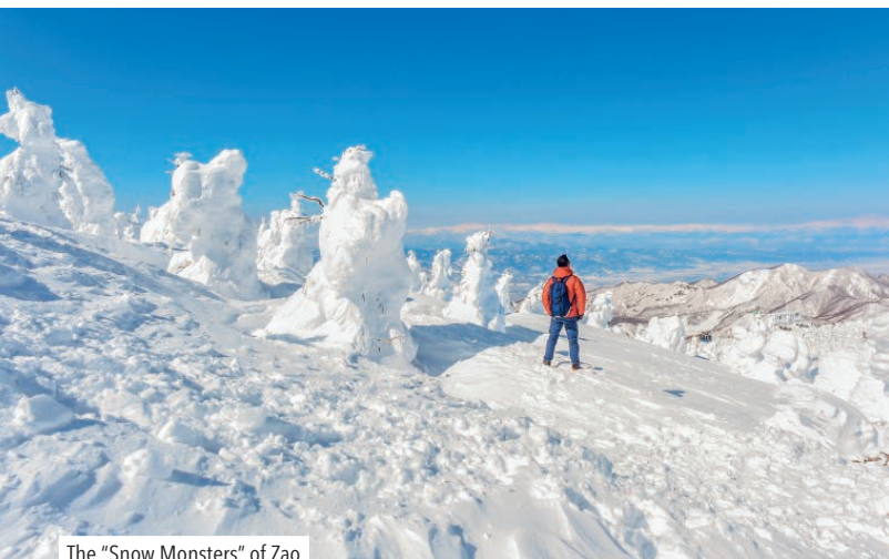
The "Snow Monsters" of Zao

across from Russia. The air is trapped by Mount Kumano (1,841m) and frozen water droplets cover the mountain's conifers with a thick layer of snow and ice. It can be an extraordinary sight as nature creates icy creatures that look like a horde of frozen Godzillas! Two direct tours every day mid-Dec-mid-March | for bookings phone 0224 85 30 55 | tickets 4,800-6,800 yen | "Juhyo-go" bus from JR station Sendai, end of the village, exit at Sumikawa Snow Park | zaospa.or.jp/english