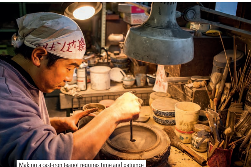
Making a cast-iron teapot requires time and patience

the habitat of the Asian black bear, black woodpecker and Japanese serow – a goat-like mammal. Today, 170km 2 remain of an unspoilt birch forest that was once the largest in East Asia. From the castle city of Hirosaki you can go on a beautiful half- or full-day hike through the forest. Calculate between two to three hours for the popular return route to the three