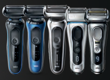
Shavers Series 5, 6, 7, 8, 9, 9 Pro and 9 Pro+

If you don't think your Braun product has delivered superior results, get your money back by sending this form, your proof of purchase and your product to the address shown below