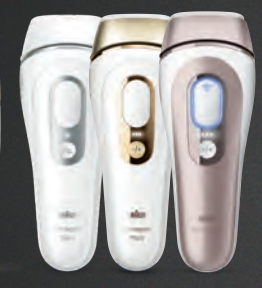
Silk-expert Mini, Pro 3, Pro 5 and Skin i-expert 7