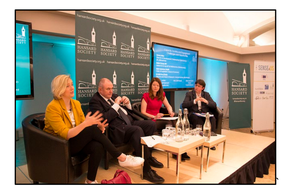
Stella Creasy MP speaking at our 'Future Parliament' event during Parliament Week

The Hansard Society works in the UK and around the world to strengthen parliamentary democracy and encourage greater public involvement in politics