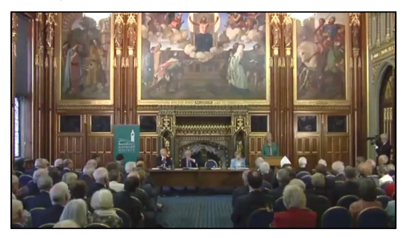
Lord Speaker Hustings, Robing Room, House of Lords, 25 May 2016

Any private benefits are incidental as a necessary by-product of carrying out the Charity's aims. Staff are employed and remunerated in order that the Charity's aims are met.