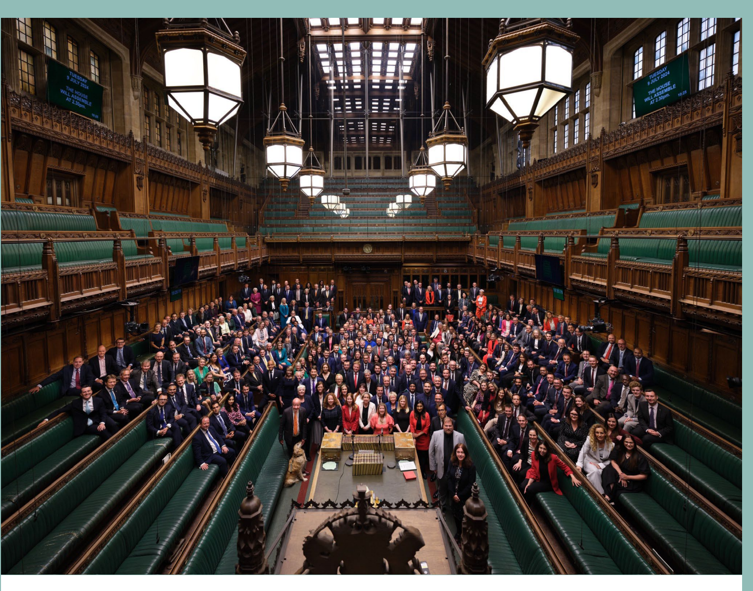
The new "class of 2024" MPs in the House of Commons chamber, July 2024

Unlike other think tanks and organisations focused on governmental effectiveness, the Society does not have the security of support from significant philanthropists. Those organisations can plan confidently each year with multi-million-pound gifts and endowments, but we face annual