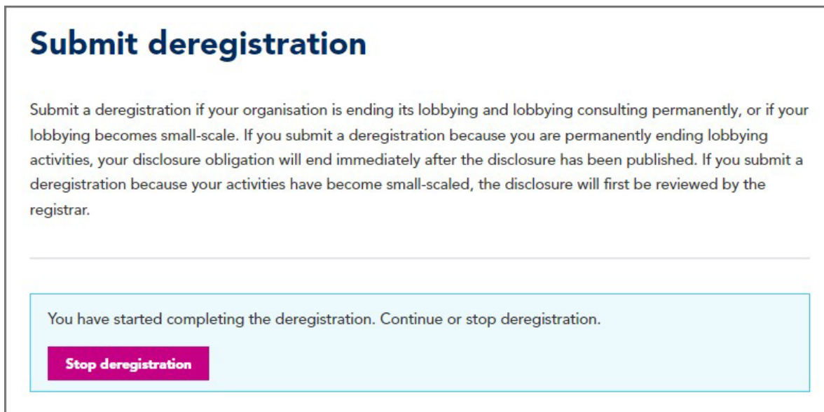
Figure 6. Stopping deregistration.

Contact avoimusrekisteri@vtv.fi if you have sent a deregistration to the registrar for checks as a small-scale lobbyist and you want to stop the deregistration.