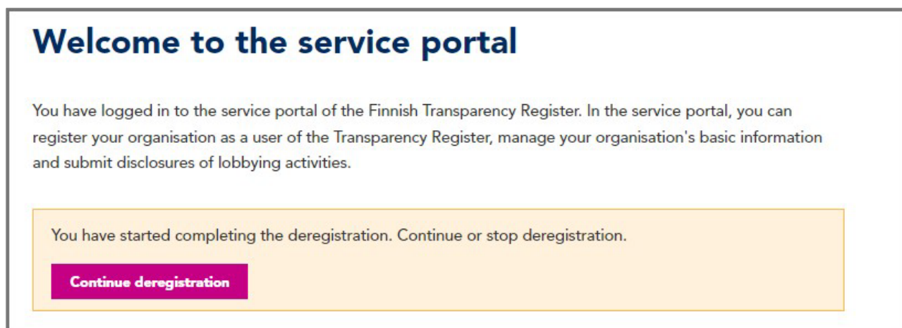
Figure 5. Reminder of incomplete deregistration.