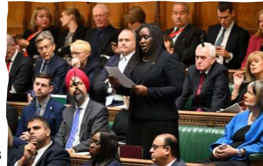
MPs representing constituents in 1805 & 2023