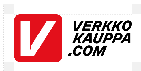
Versions 1.0 & 2.0

A minimum clear space must surround the logo unless otherwise specified. This space is defined by the height of the O in the text logo. In versions 1.0 and 2.0, the clear space begins at the edges of the V-mark background. In version 3.0, the clear space begins at the edges of the text logo and background-less V-mark. The clear space is included as a transparent area in every original logo file.