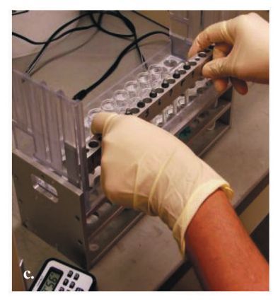
c. Treatment with dentifrice slurry (1:5) daily for six days.