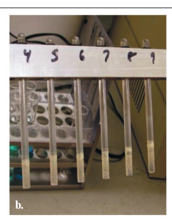
b. Two-day biofilm grown from human saliva.