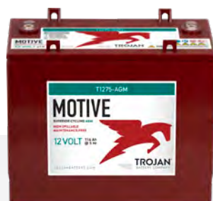
MOTIVE 12-VOLT AGM