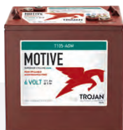
MOTIVE 6-VOLT AGM