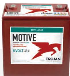
MOTIVE 8-VOLT AGM

C-Max Technology Proprietary Paste Premium Separator