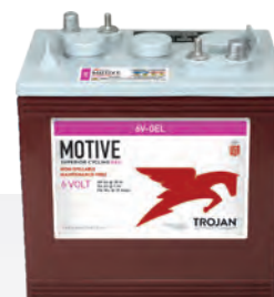
MOTIVE 6-VOLT GEL