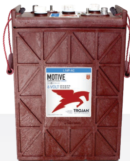
RUGGED MOTIVE 6-VOLT