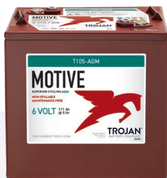
MOTIVE 6-VOLT AGM