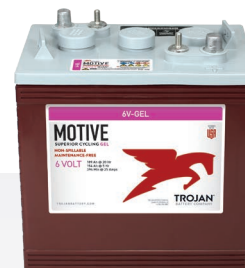
MOTIVE 6-VOLT GEL