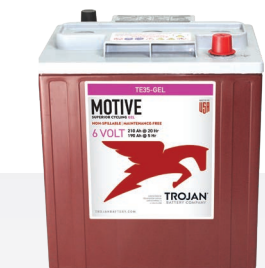
MOTIVE 6-VOLT GEL

Proprietary Gel Premium Separator Rugged Construction