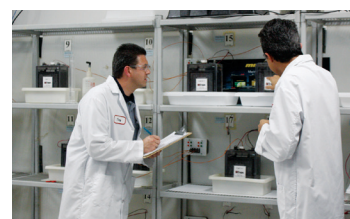
Prototype development and evaluation

To ensure the quality and superior performance of our batteries, Trojan applies the most rigorous testing procedures in the industry to test for cycle life, capacity, charger algorithms and both physical and mechanical integrity. Trojan's