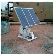
Chemical Injection Pumps