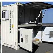
Mobile & Temporary Facilities