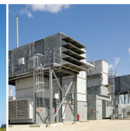
Central Power Stations