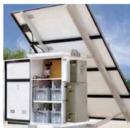
SCADA Monitoring & Control