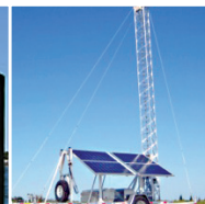
Security & Surveillance