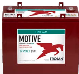
MOTIVE 12-VOLT AGM