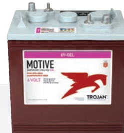
MOTIVE 6-VOLT GEL