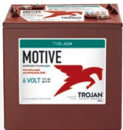
MOTIVE 6-VOLT AGM