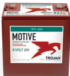
MOTIVE 8-VOLT AGM