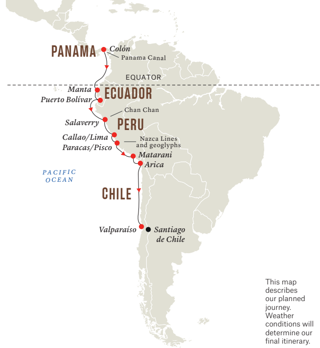
This map describes our planned journey. Weather conditions will determine our final itinerary.

Day 8 Callao/Lima (Full day) We dock at the port of Callao and drive the short distance to Peru's vibrant capital city, Lima. Admire the ornate colonial architecture and see why Lima was called 'The City of Kings.' INCLUDED EXCURSION: Scenic City Tour of Lima