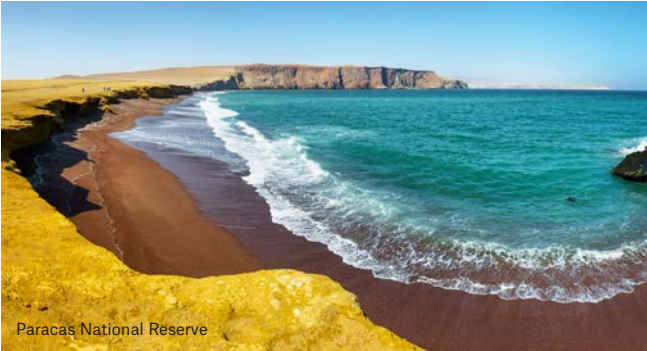
Paracas National Reserve