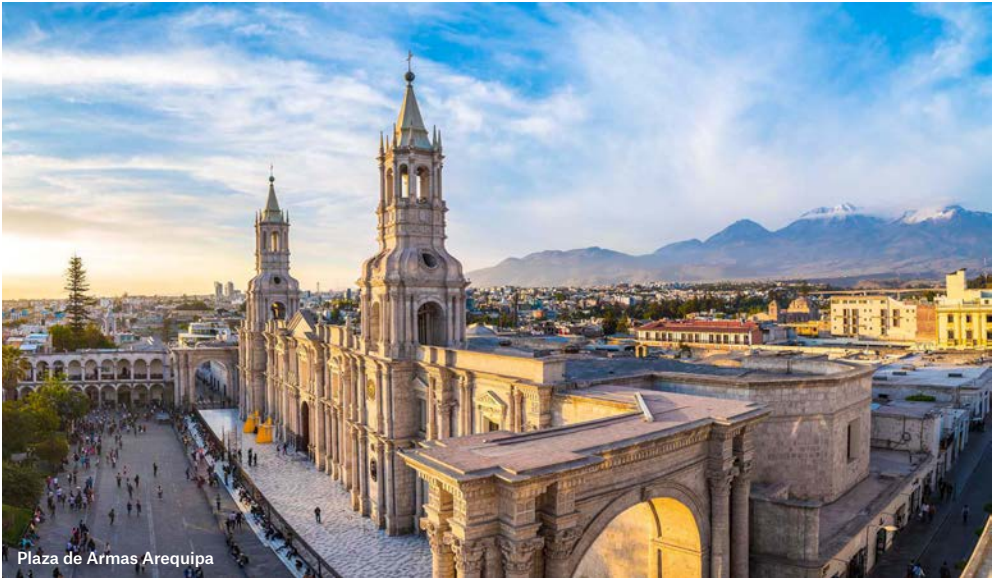
Plaza de Armas Arequipa