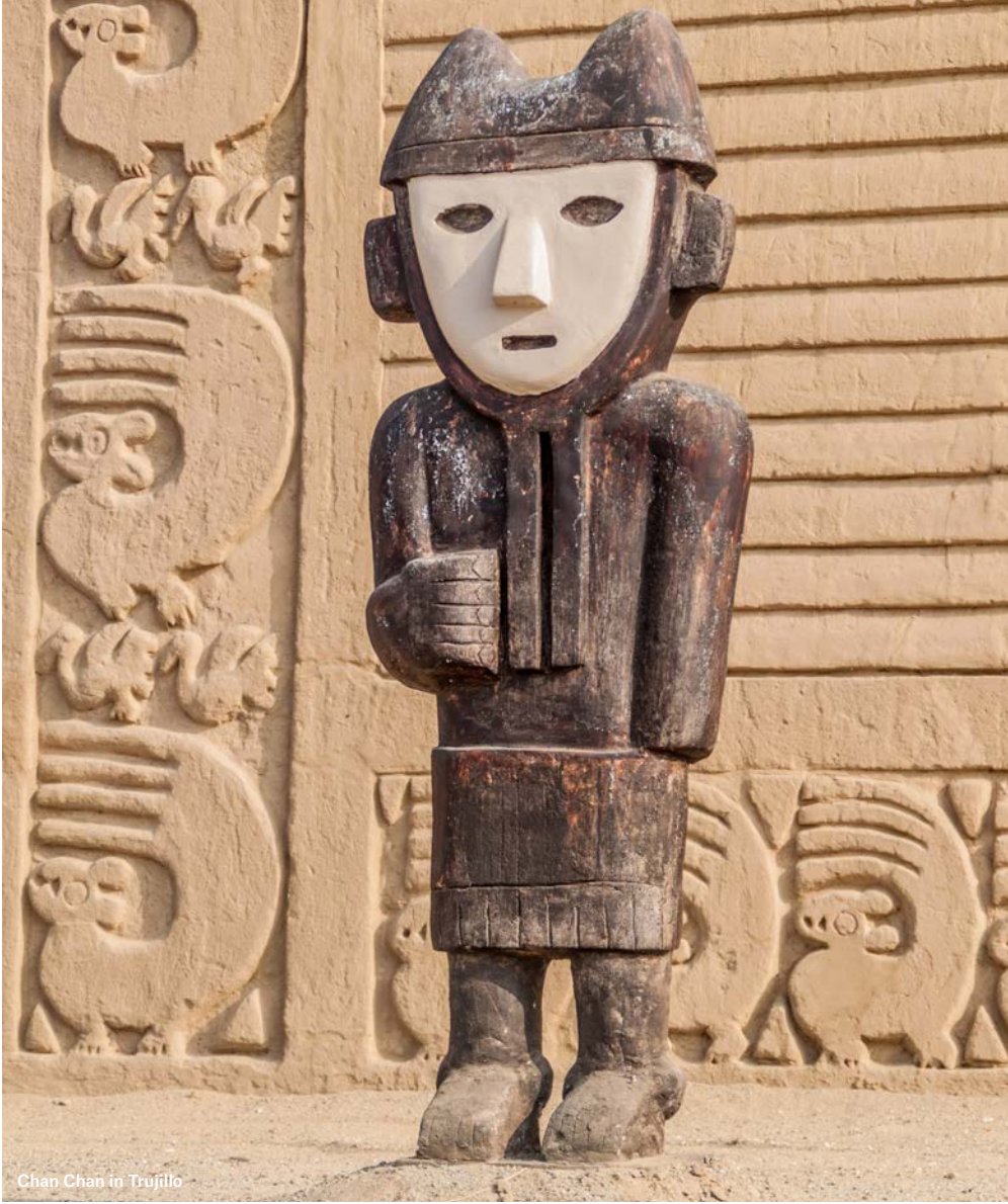
Chan Chan in Trujillo

Please note: We offer two itineraries on this expedition. The outline below the map describes the planned Itinerary 1. Weather conditions will determine our final itinerary.