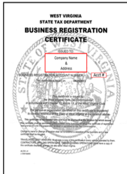
Business Registration Certificate Example