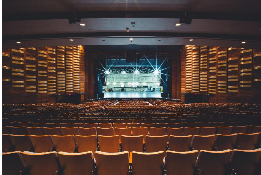
This picture shows the Meridian Hall auditorium stage from the back of the orchestra.

The seats in the Meridian Hall auditorium are between 19” and 22” wide, with most of our seats being 20” and 21” wide. If you need additional room, please contact our box office team either ahead of your visit or during your visit who would be happy to assist you.