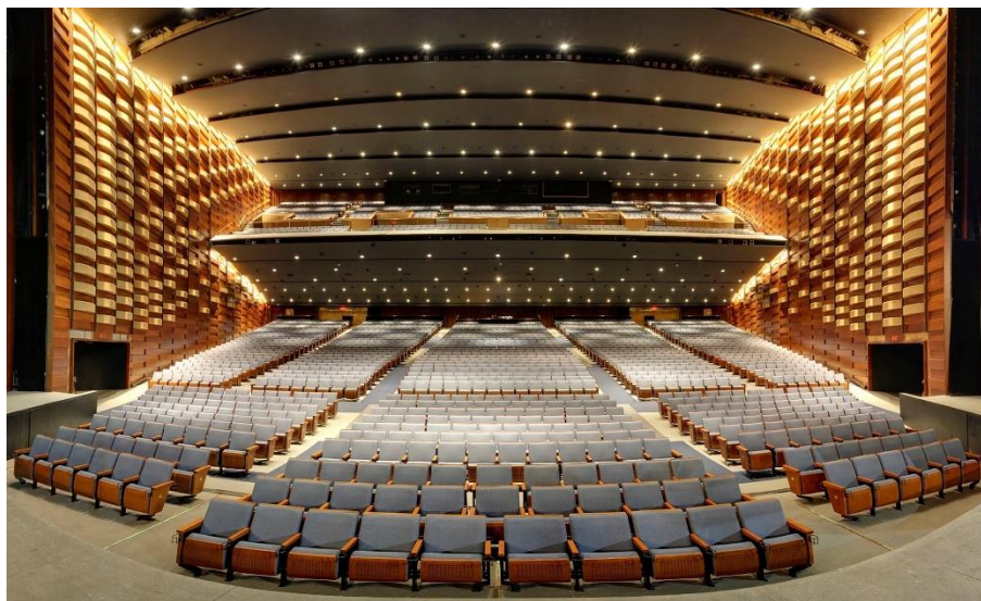
This picture shows the Meridian Hall auditorium from the stage.

A venue guide for Meridian Hall is available here .