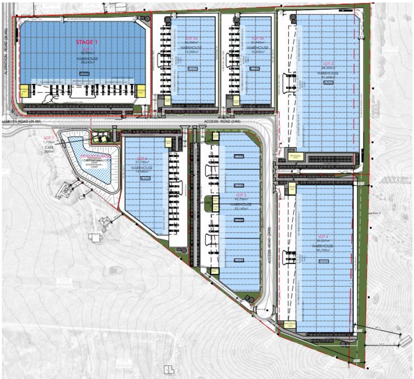
Figure 1 ESR Kemps Creek Logistic Park

The current study covers the sustainability management plan for the Master Plan.