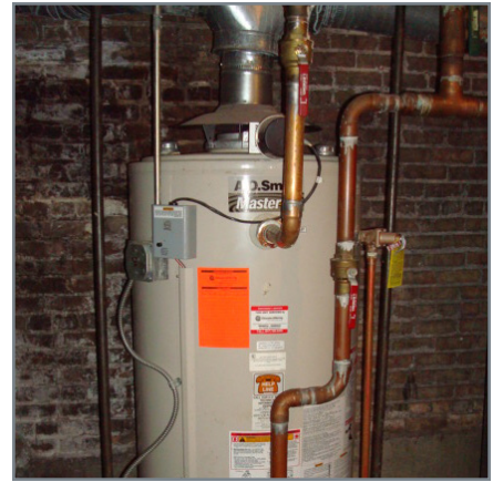
Water heater at 2212-2214 N. Sacramento Ave./3001 - 3003 W. Lyndale St.