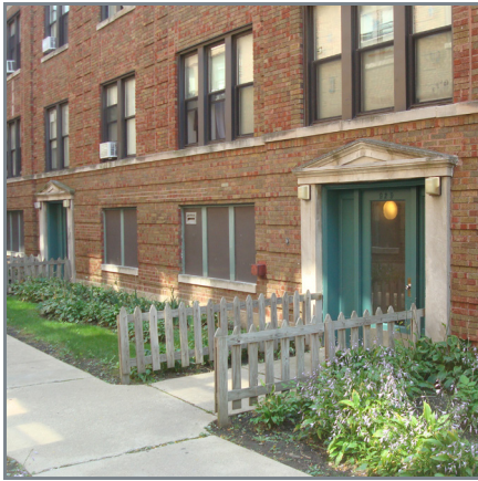
Exterior of 929 - 935 N. Sacramento Avenue

Case Study: Boulevard Apartments, owned by Bikerdike Redevelopment Corporation