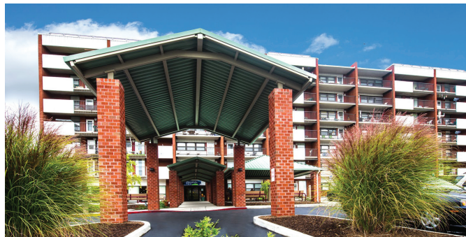
Mountain View Apartments