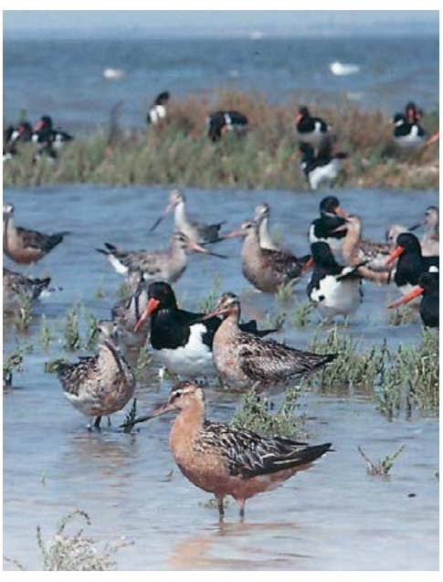
Above. Strangford Lough Waders

to generate better insights and understanding that supports the long-term future of the marine environment