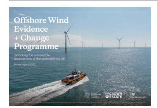
An investment in our UK-wide Offshore Wind Evidence and Change Programme of

We also provide leases for aquaculture activity throughout Northern Ireland. This includes kelp farming (see our case study) and a lease with Queen's University Belfast for research purposes at Jackdaw Island, Strangford Lough. In the year, researchers studied the effects of oscillation in the growth of juvenile seaweed under controlled conditions. Its paper on the work has been accepted for publication.