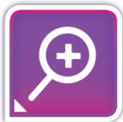
FOCUS ON INSURANCE

Passionate Focused to deliver. Entrepreneurial. on customers. Teamwork. Trusted. Local.