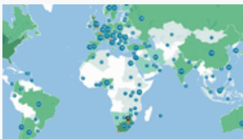
The image above shows the institutions collaborating with University of Johannesburg globally.