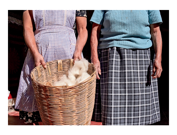
Left: Members of the Vida Nueva women's cooperative in Teotitlán del Valle in Oaxaca Above: Cooks preparing dinner at Pocoapoco, in Oaxaca

These days there is a growing number of inquisitive, well-seasoned travelers who want to do more than check off a bucket list or fill their Instagram feeds with street food and sunsets. They want to have authentic, local experiences; that could mean sourcing ingredients and cooking with one of the best chefs in the world in Italy, or it could be learning century-old ways of weaving with a female collective in a village outside of Oaxaca, Mexico. These travelers know that by learning a new craft or skill, they are also giving back to the community by supporting local artisans and helping keep traditional arts alive. So to meet this new demand, a new crop of luxury travel