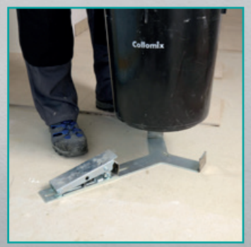
The adjustable foot treadle allows clamping of a wide range of bucket diameters.

mix.GRIP provides a solution, because it always has the bucket firmly under control. Thanks to the adjustable foot treadle, buckets of diameters between 250 and 325 mm can be secured quickly and easily.