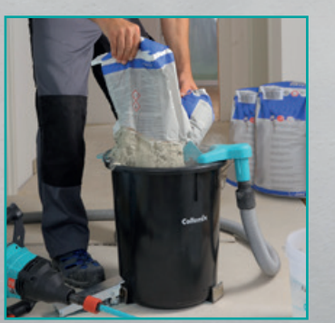
dust.EX and a vacuum cleaner with "M" class filter.