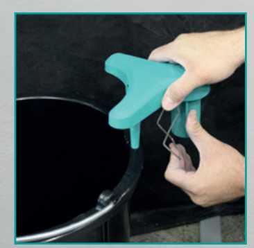
The spring clamp allows use with different bucket sizes.