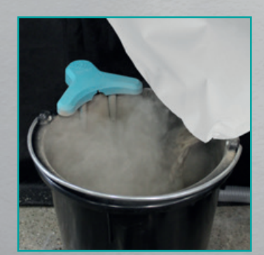
The dust.EX extracts the mate- Keep a clear view with the rial directly from the bucket almost no dust escapes.