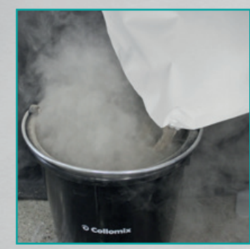
While filling the bucket, a large amount of dust is produced.

cleaner. The clamping spring enables attachment to almost