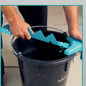
The SHARKY bag ripper can be optimally combined with the dust.EX vacuum cleaner.