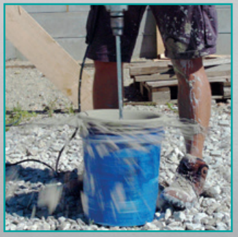
The mix.GRIP makes overspinning buckets a thing of the past.