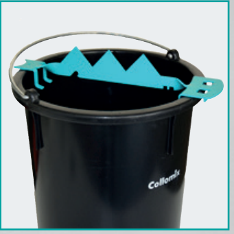
The SHARKY bag ripper is compatible with a wide range of bucket diameters.