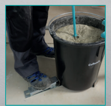
A full body system, which fixes the bucket in place ergonomically and without strain.