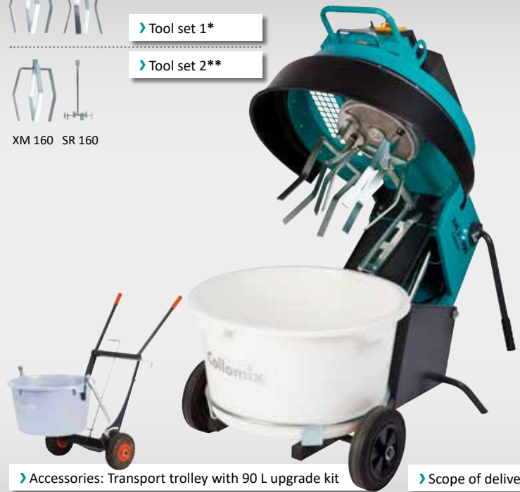
▶ Accessories: Transport trolley with 90 L upgrade kit