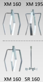
▶ Tool set 1*