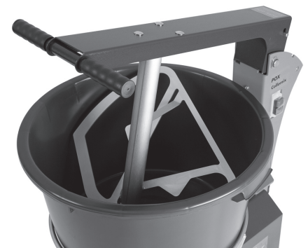
The POX when closed