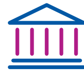
Ethics & Corporate Responsibility

Every day, we work to be a force for good and a force for growth. Our aspiration is to positively impact all our stakeholders in each area of our Citizenship work: Ethics & Corporate Responsibility, Community Impact, Diversity & Inclusion, Gender Equality and Environmental Sustainability.