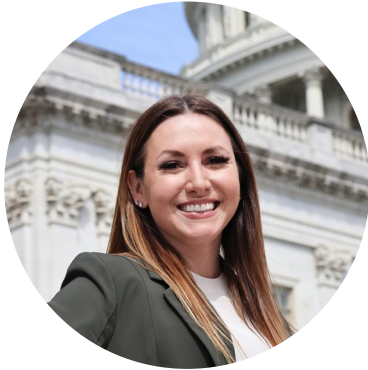
Director of Federal Affairs