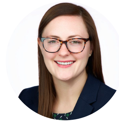
Director of Congressional Affairs