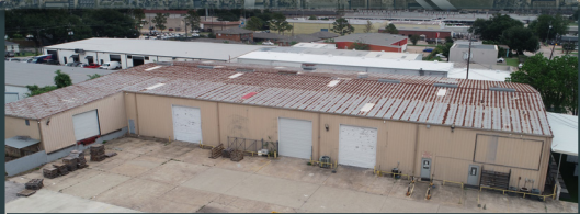
5800 Centralcrest St, Houston, TX 77092