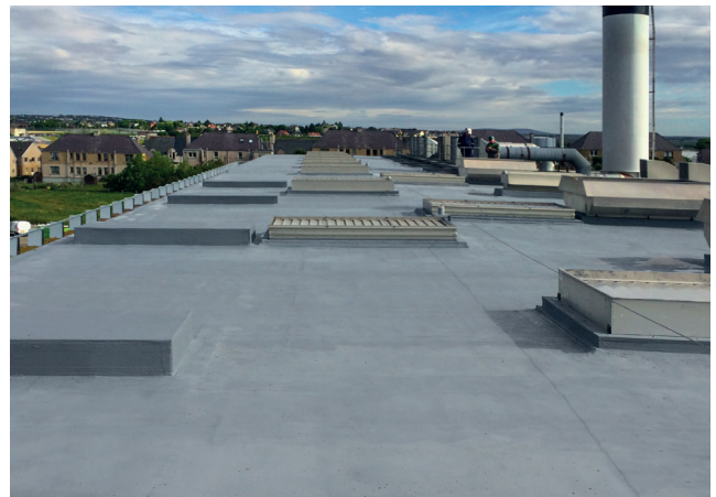
Stornoway Power Plant, Isle of Lewis, Outer Hebrides, UK