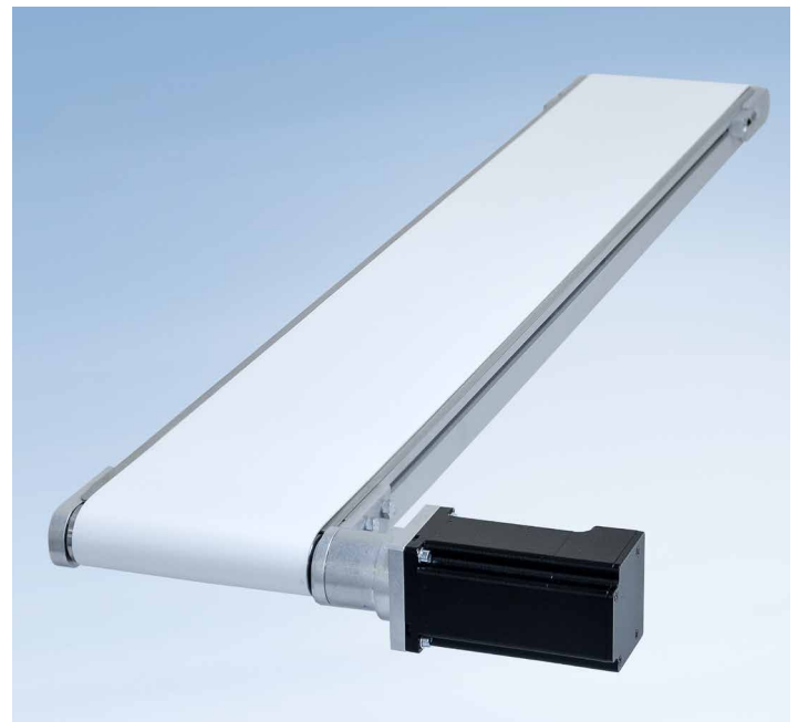
GUF-P MINI, AE head drive, Igus stepper motor, 24 or 48V

Find more information about our belt conveyors here: