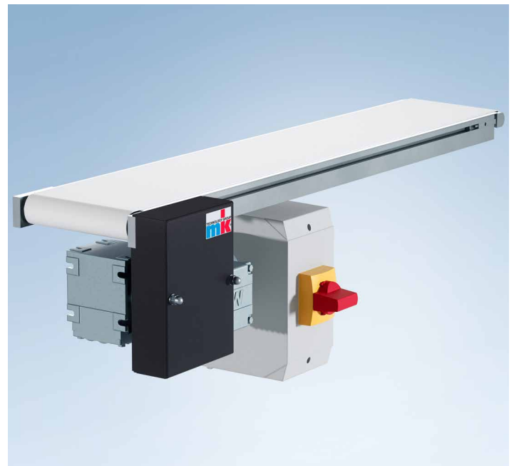
GUF-P MINI, AD head drive 90 W, with motor protection switch (optional)

The motor protection switch is used for power supply of the motor and meets, with motor protection and a main switch, the requirements of the Machinery Directive for a complete machine. In addition, a 24V DC interface is available for start/stop control. It is installed in a separate IP54 PVC housing and is wired ready for connection with plug connections. The supply voltage is 400V AC/50 Hz/16A.