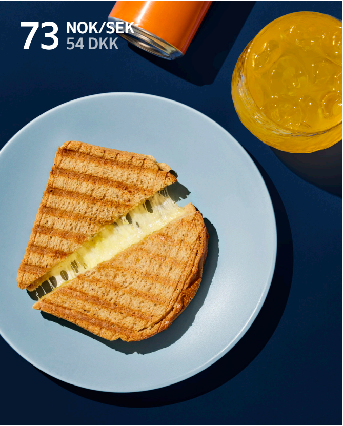
73 NOK/SEK 54 DKK TOAST & DRINK Combine 1 toast + 1 soft drink and save 20% DKK 54, NOK/SEK 73, EB 1300