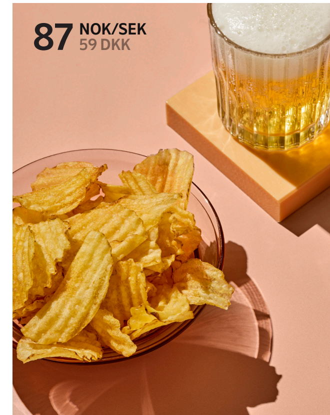
BEER & SNACK Combine 1 Mikeller IPA + 1 bag of chips or cashew nuts and save 20% DKK 59, NOK/SEK 87, EB 1600