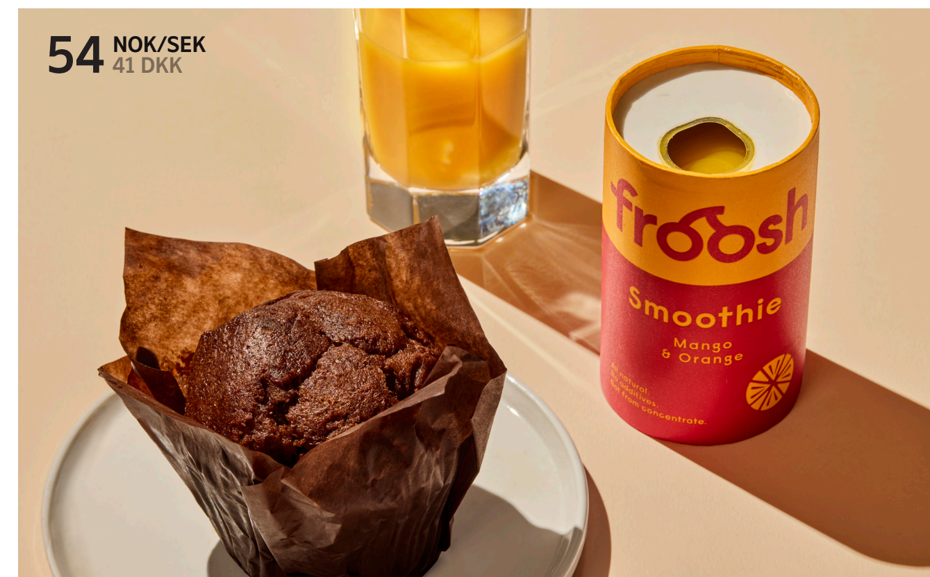
SMOOTHIE & SNACK Combine 1 smoothie + 1 muffin or chocolate ball and save 15% DKK 41, NOK/SEK 54, EB 950