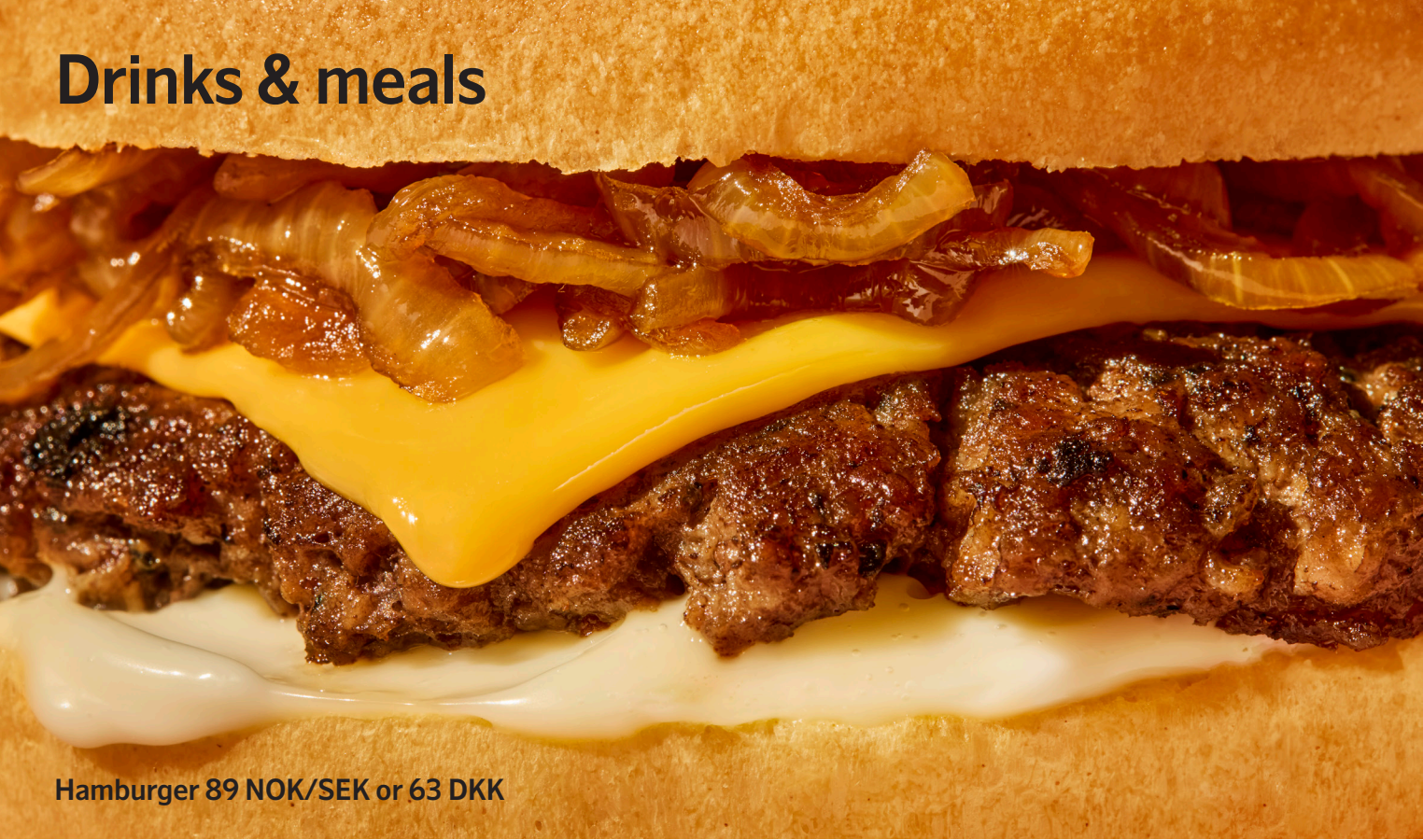
Hamburger 89 NOK/SEK or 63 DKK