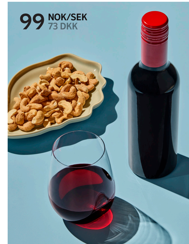
WINE & SNACK Combine 1 red/white wine + 1 bag of chips or cashew nuts and save 20% DKK 73, NOK/SEK 99, EB 1800