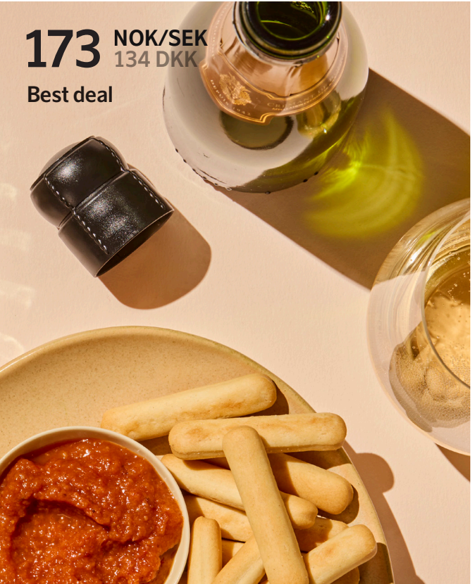
173 NOK/SEK 134 DKK Best deal ANTIPASTI & SPARKLING WINE Combine 2 antipasti boxes + 2 sparkling wines and save 50% DKK 134, NOK/SEK 173, EB 3800