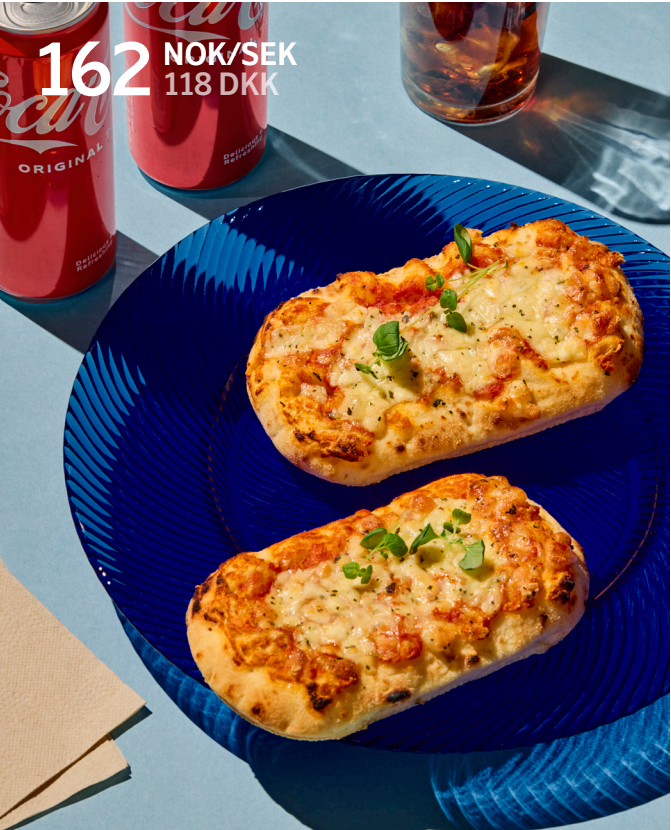
162 NOK/SEK 118 DKK TWO PIZZAS & DRINKS Combine 2 pizzas + 2 soft drinks and save 20% DKK 118, NOK/SEK 162, EB 3000