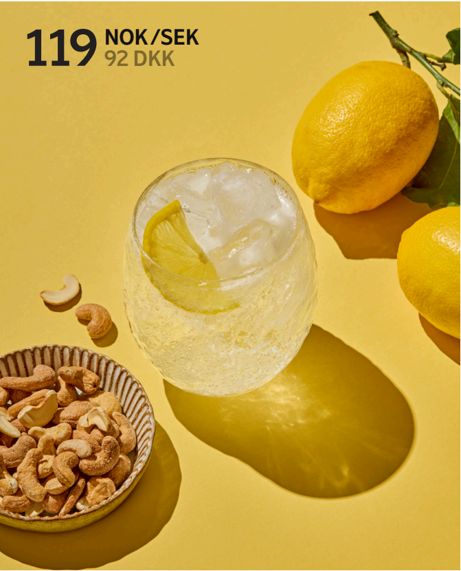
119 NOK/SEK 92 DKK COCKTAIL & SNACK Combine 1 Gin & Tonic, Vodka & Ginger or Vodka Mojito + 1 bag of chips or cashew nuts and save 20% DKK 92, NOK/SEK 119, EB 2300