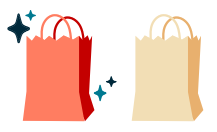
Half of adults with ADHD (49%) say that their ADHD impacts their ability to buy their loved ones gifts .

More than half of adults with ADHD say that it affects their ability to organize and finish tasks (56%) or buy gifts on time (52%) .