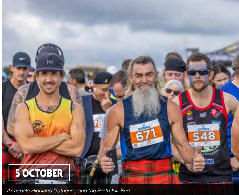
Armadale Highland Gathering and the Perth Kilt Run