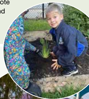
Above: Armadale Primary School Right: Kelmscott Primary School Below: Aspiro Primary School

This program gives students the chance to gain hands-on experience with nature by providing plants for their school's environmental areas, encouraging direct engagement with the environment and creating a deeper connection to nature. Thanks to all the schools involved who helped us promote environmental responsibility through education, awareness, and support for our Urban Forest initiatives.