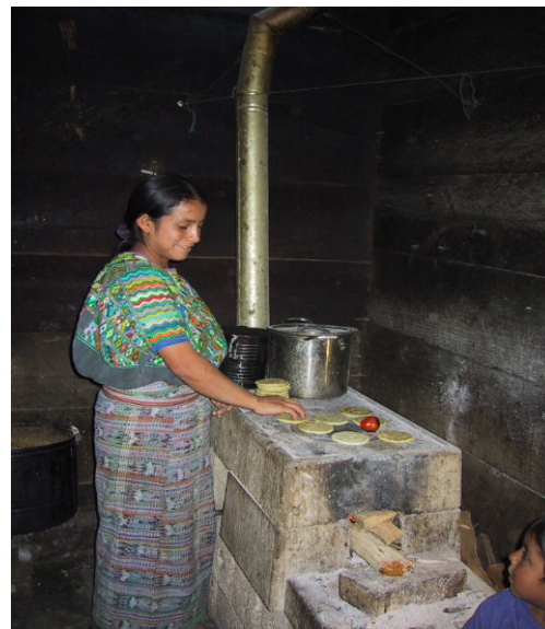
Figure 1: A well-designed chimney stove disseminated by HELPS International in Central America.

Clips at the top and bottom of the flue mean that it can be easily removed for cleaning. The opening for the fuel is exactly the right size, and there is a small bar across the opening close to the bottom to ensure that air can pass underneath the fuel so that the fuel burns completely. The material for the stove is based on a