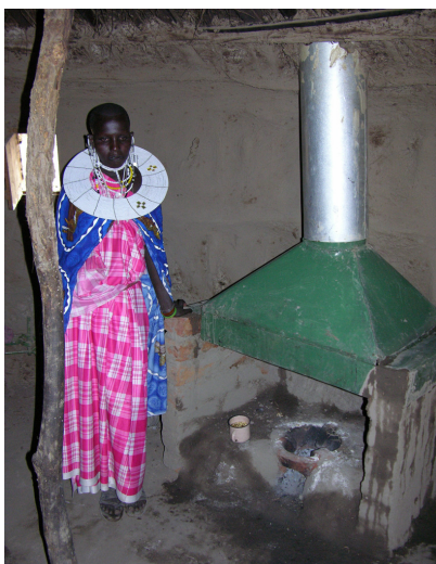
Figure 4: Maasai woman standing beside her smoke hood, Tanzania.

combined with a smoke hood, with the stove reducing emissions and fuel costs, and the smoke hood venting any residual smoke up the smoke hood. The smoke hood is sufficiently versatile to allow these changes to happen.