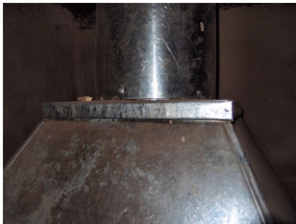
Figure 6: Detail of the metal fold at the hood intersection.