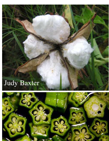
Cotton boll & okra