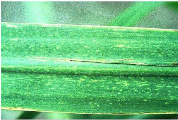
Early rust symptoms on sugarcane.

Very few photos of ORS are available. The top two photos below are photos of a similar sugarcane rust, Puccinia melanocephala , which in its earlier stages may resemble ORS. ORS has the typical rust-type symptoms often seen on sugarcane.