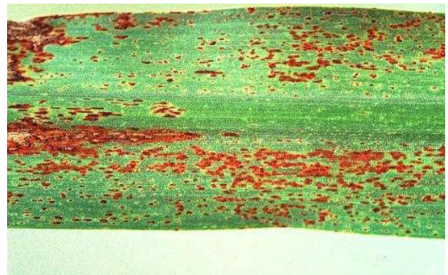
Rust ( Puccinia melanocephala ) symptoms on sugarcane.