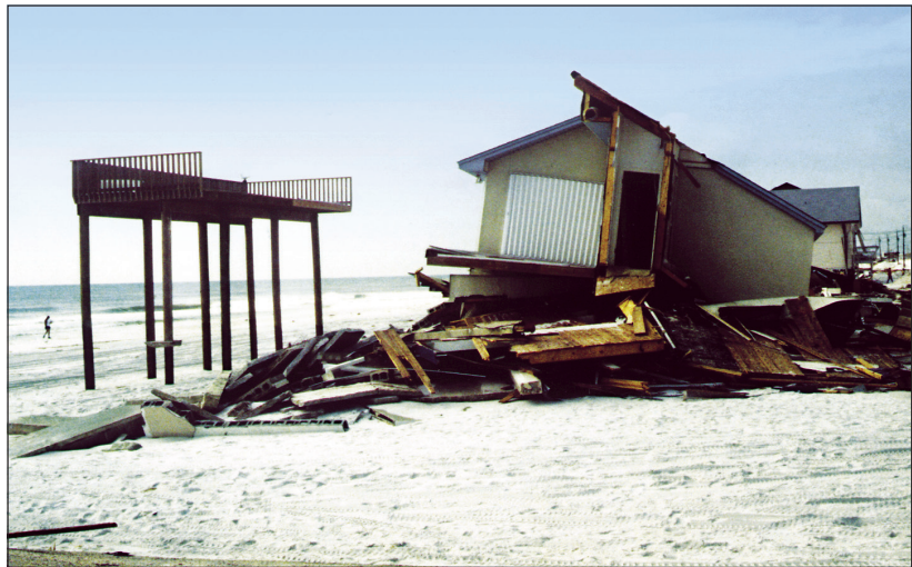
Damage from Hurricane Opal in Florida. This deck was designed to meet State of Florida Coastal Construction Control Line (CCCL) requirements. The house predated the CCCL and did not meet the requirements.

and/or wind forces. Decks should be given the same level of design and construction attention as the main building, and failure to do so could lead to severe building damage.