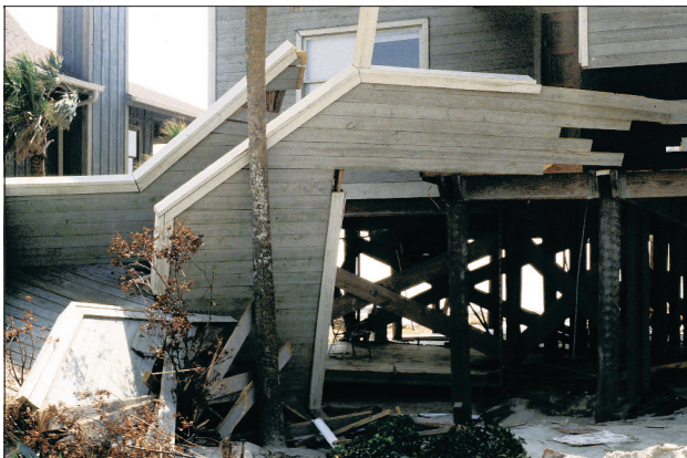
The rails on these stairs were enclosed with siding, presenting a greater obstacle to the flow of flood water and contributing to the flood damage shown here.