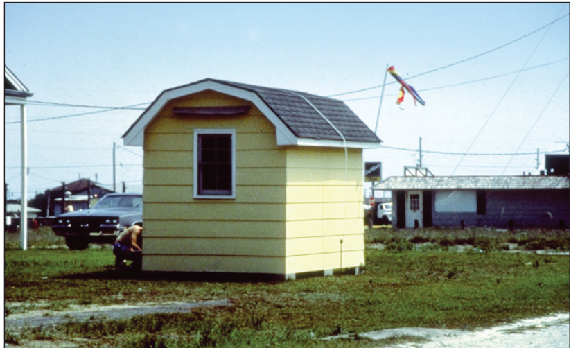
Small accessory building anchored to resist wind forces.