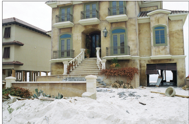
Large solid stairs such as these block flow under a building and are a violation of NFIP free-of-obstruction requirements.