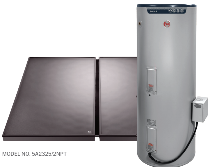
MODEL NO. 5A2325/2NPT