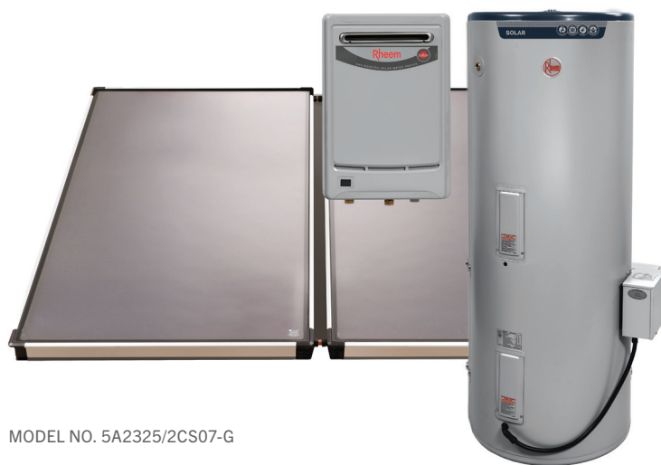
MODEL NO. 5A2325/2CS07-G