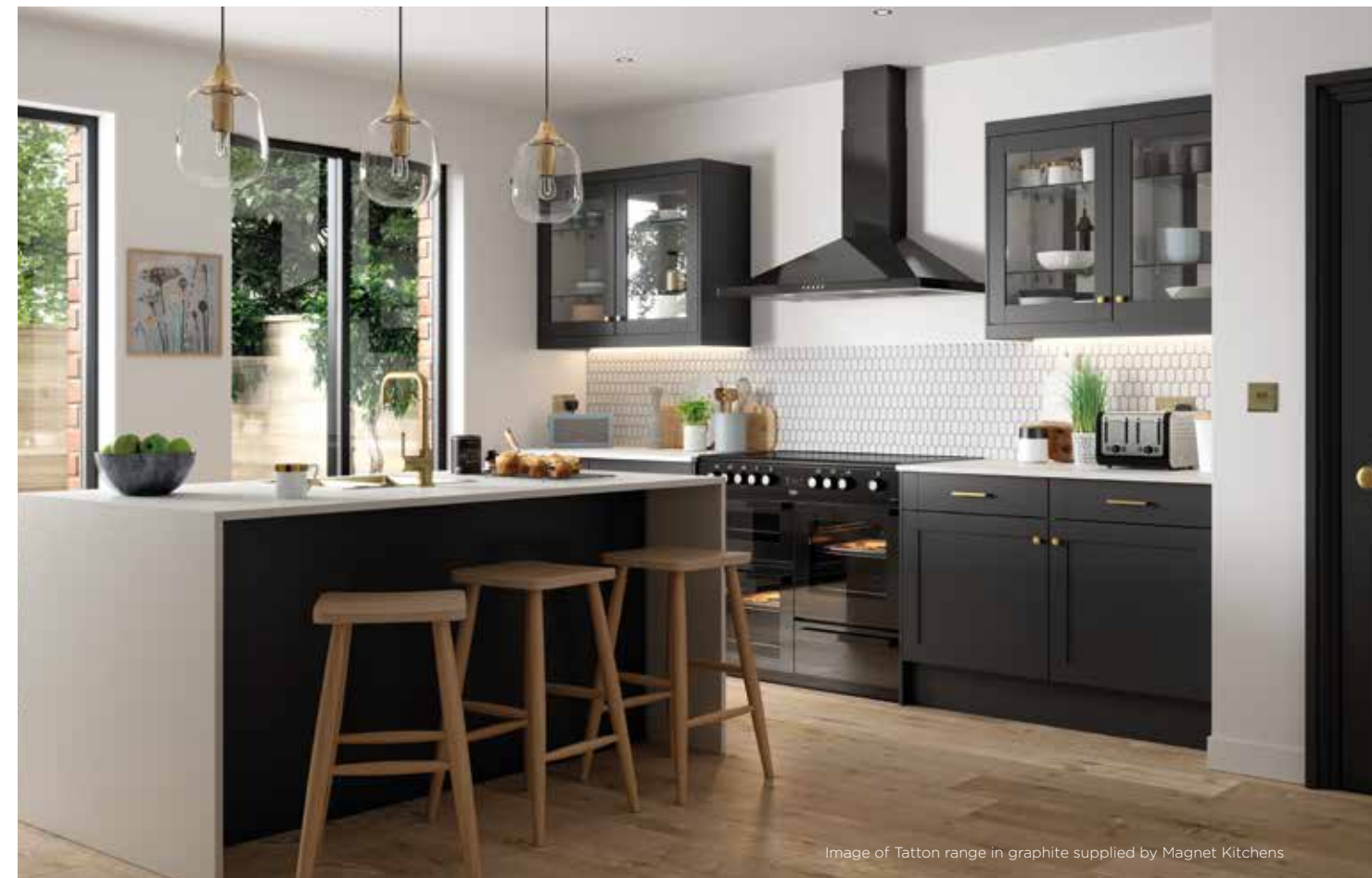
Image of Tatton range in graphite supplied by Magnet Kitchens