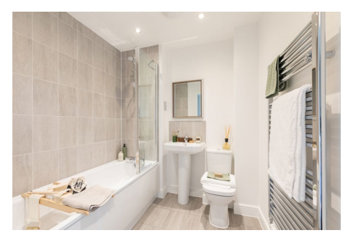
Any floor plans are a general outline of the layout of the property for guidance only. All measurements are approximate and may vary and any intending purchasers should not rely on them as statements of fact or representations of fact but must satisfy themselves by inspection or otherwise as to their accuracy. Dimensions shown are not intended to be relied upon for installation of appliances or items of furniture or otherwise. CGI's and images are for illustrative purposes only. Specifications are subject to change. Images are indicative only and may be of previous developments.*Journey times and distances taken from google.com/ maps and are correct before going to print. All times and distances listed are approximate and may vary depending on time of travel.