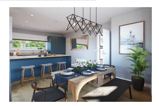
Any floor plans are a general outline of the layout of the property for guidance only. All measurements are approximate and may vary and any intending purchasers should not rely on them as statements of fact or representations of fact but must satisfy themselves by inspection or otherwise as to their accuracy. Dimensions shown are not intended to be relied upon for installation of appliances or items of furniture or otherwise. Cgi's and images are for illustrative purposes only.