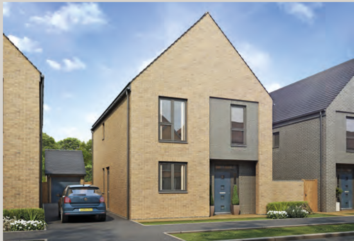
Disclaimer: Images and CGIs are for illustrative purposes only and are correct at time of print.

Harmony provides four well-proportioned bedrooms, a spacious living room and a good-sized kitchen and dining area. This home is available detached or semi-detached.