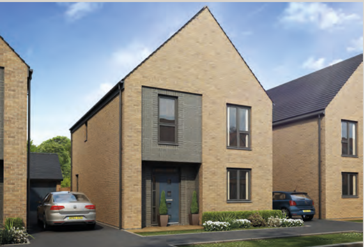
Disclaimer: Images and CGIs are for illustrative purposes only and are correct at time of print.

A home with the ‘wow’ factor; a beautiful detached four bedroom home that benefits from vaulted ceilings and versatile living spaces that are sure to impress your guests!