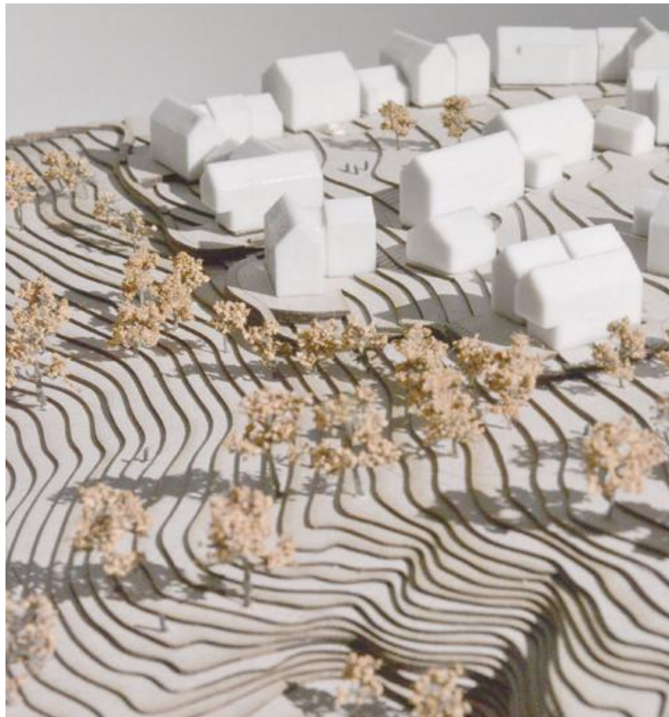
Quote and imagery by JTP architect and masterplanner

We looked to retain and enhance the existing landscape wherever possible by providing new green corridors, establishing a nature reserve within the old quarry, introducing wetland habitats with swales and ponds and creating a huge area of parkland across the centre of the development.